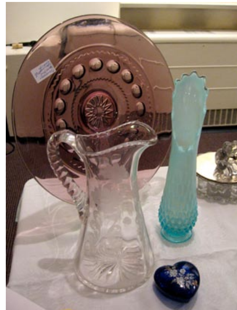
Show & Tell