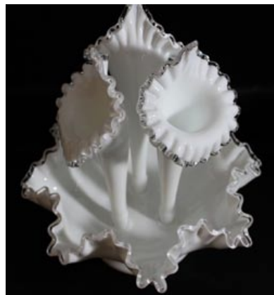
Pictured at left is a Fenton Silvercrest epergne. At right is a Fenton cranberry opalescent epergne.