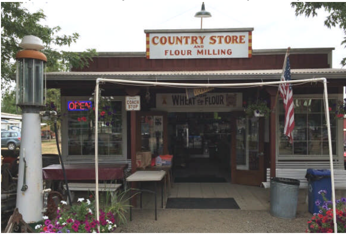
GENERAL STORE, RIGHT NEXT TO THE PICNIC AREA

Powerland is a very interesting park. It is a 62-acre campus with several museums on it, including Antique Caterpillar Machinery, Oregon Electric Railway, Oregon Vintage Machinery, a Blacksmith Shop and many more. Plus, the grounds have several antique tractors right out in the open, so you can get up close and really see what they are like. It was a perfect place for our picnic.