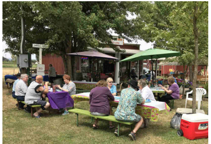
A LONG VIEW OF THE PICNIC AREA