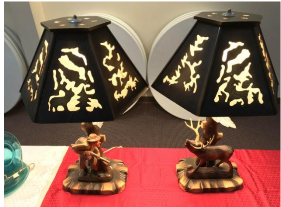
Elmer Heffner—Pair of wooden lamps with wooden shades made in Germany