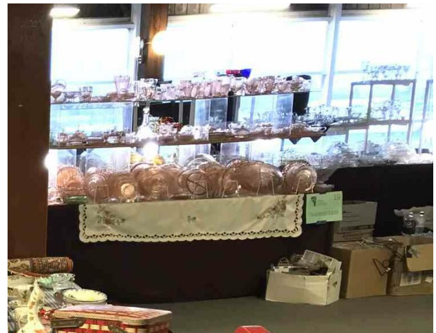
CRAZY 4 ANTIQUES