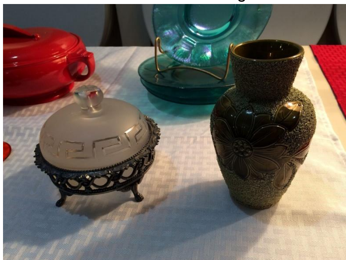
Jean Zitzer—Victorian-era “Greek Key” satin glass powder in silver plate holder; English pottery vase c.1880s