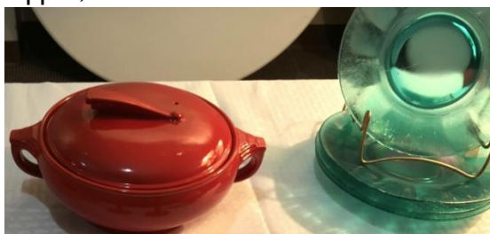
Barbara Coleman—1920s stretch glass plates; Hall casserole c. 1940s