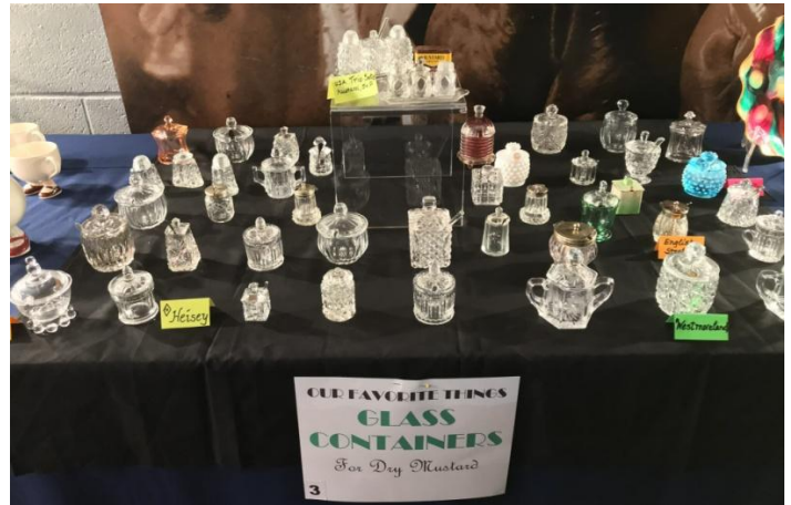
RANDY DAVID'S DRY MUSTARD POTs