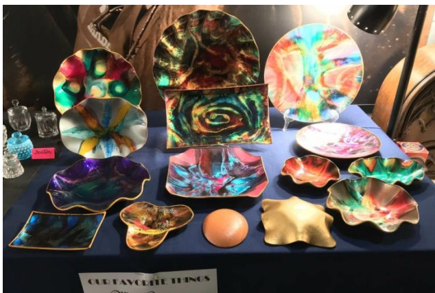
DIANE FOSTER'S MID-CENTURY PIGSKIN GLASS