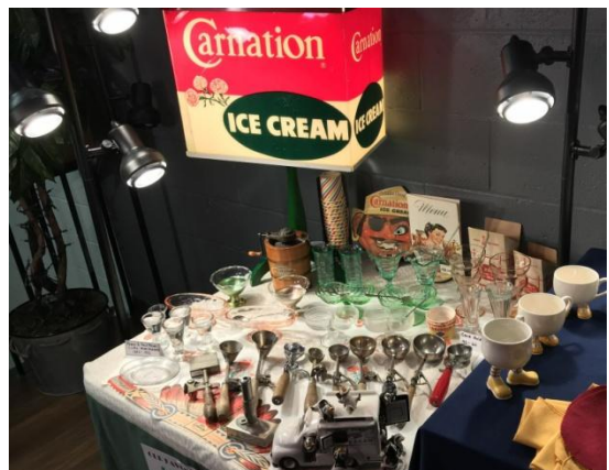
ED MARTIN'S I Scream FOR ICE CREAM