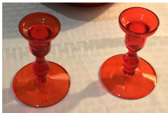
Mable Hardebeck—Morgantown tangerine candle holders