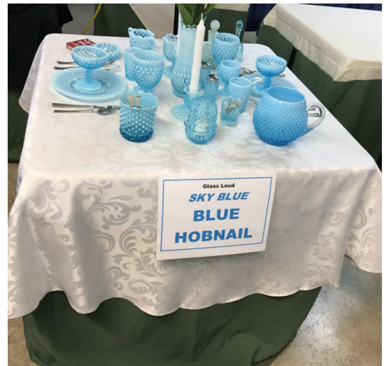
FENTON BLUE OPALESCENT HOBNAIL BY JAN BAXTER