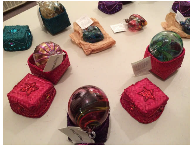
GLASS EYE ORNAMENTS WE AUCTIONED OFF