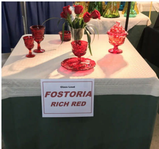
FOSTORIA RICH RED BY SUSAN CONROY