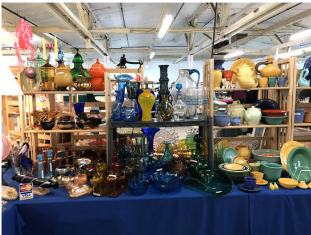
LOTS OF GREAT GLASS, CHINA, POTTERY, SILVER TO CHOOSE FROM