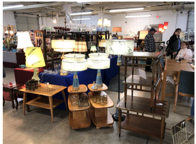
EVERYTHING FROM VICTORIAN TO MID-CENTURY MODERN