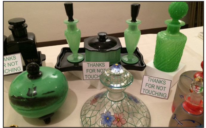
Favorite Finds of 2015 continued