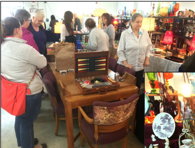
Fun at the 2016 Glass Sale