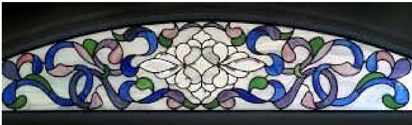
POVEY BROTHERS STAINED GLASS WINDOW

Did you know that Portland had a stained glass company that ranked right up there with Tiffany? It was the Povey Brothers Studio, and it was in business from 1888 to 1928. Povey Brothers is one of the topics we are considering for the 2018 Glass Collectors Convention topics.