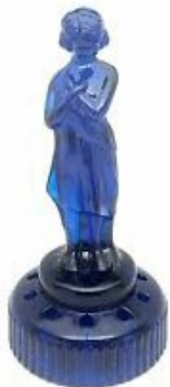
CAMBRIDGE DRAPED LADY FIGURAL FLOWER PROG

Registration forms will be available beginning at the January Vintage Marketplace at Portland Meadows