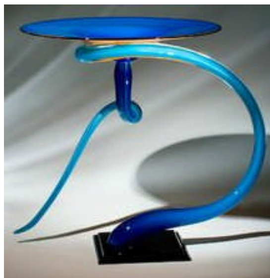
R STRONG ART GLASS

NEXT CONVENTION MEETING TUESDAY, FEBRUARY 27, LOCATION TBD