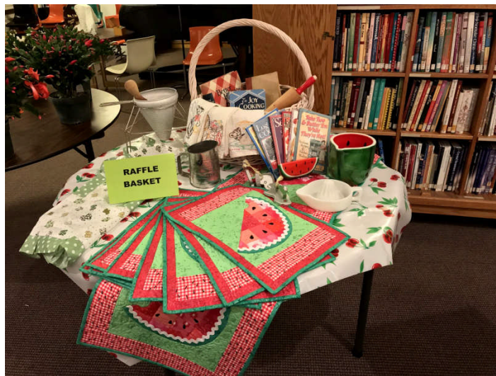
RAFFLE ITEM FOR THE 2017 SALE—A KITCHEN BASKET DONATED BY BARBARA COLEMAN AND OTHER MEMBERS—WE WOULD WELCOME DONATIONS OF OLD KITCHEN UTENSILS WITH RED OR GREEN HANDLES, SOME COLLECTIBLE SALT & PEPPER SHAKERS, AND AN OLD GREEN OR PINK GLASS MEASURING CUP.