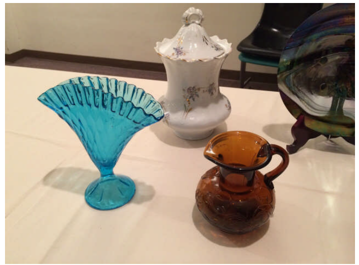
Clockwise from center: Diane Foster—amethyst pitcher with scrolls and leaves, possibly by Stevia of Italy; fan vase in Celeste blue; covered sugar bowl c. 1900 by one of the American pottery companies in Ohio; iridescent Boehm plate.