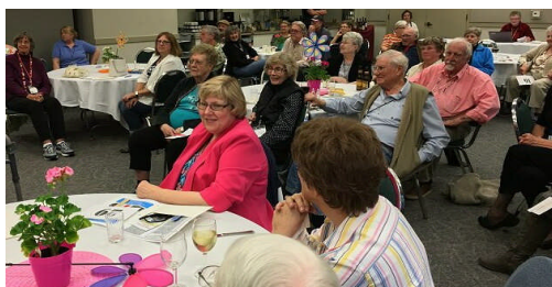
Attendees bidding on the Oral Auction