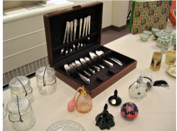
Clockwise from lower left: Set of Ball jars, Set of silver plate flatware, Hanging Hearts perfume atomizer, , two black glass perfume bottles from the Czech Republic, pink perfume atomizer, millefiori paperweight