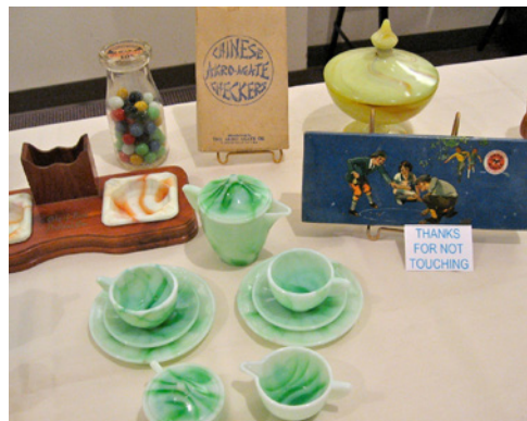
Akro Large Interior Panel dish set, "Souvenir of Portland, Oregon" wooden frame with Akro ashtrays, milk bottle with Akro Chinese Checkers marbles, marble box, Houze Glass covered candy, Akro tin litho marble box