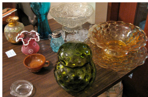
Heisey ashtray, chocolate nappy, Snow Crest vase, Art Nouveau vase, Husted vase, orange bowl & cups, Constellation bowl set, Italian covered jar, Spanish Moss muffineer sugar

Thanks to all who brought items to share from their collections: