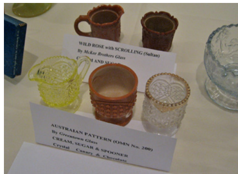
Chocolate Glass cream & sugar, child's set including creamer in canary, sugar in chocolate and a spooner in crystal