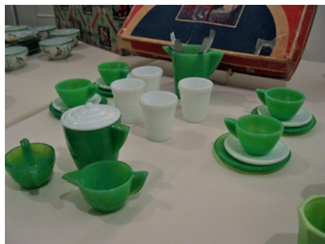
Akro Agate Concentric Rib dish and beverage boxed set