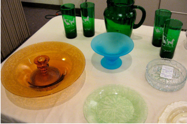
Clockwise from lower right: Florentine #1 plate, Indiana Parrot plate, Cambridge amber bowl & candleholder with etching #725, Anchor Hocking Forest Green Open Sleigh highball and pitcher set, U.S. Glass mayonnaise bowl, lead glass bowl with candle cups