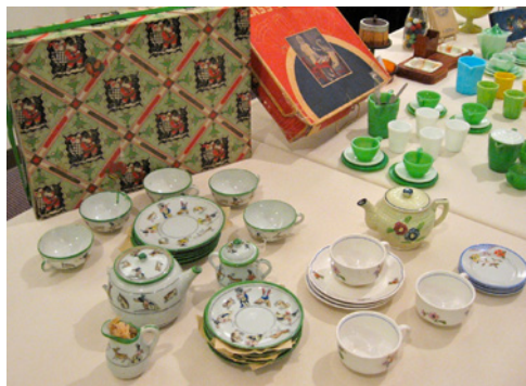
Hand-painted Nippon, Knowles & Made in Japan sets with Art Deco box