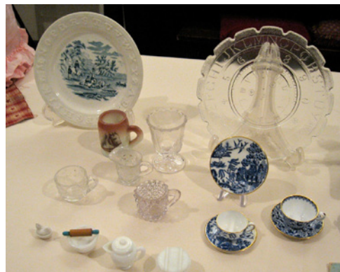
EAPG alphabet plate, china alphabet plate, Coalport trio set, milk glass miniatures, EAPG Lion pitcher, two EAPG cups & mug with house on it