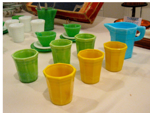
Akro Agate Octagon beverage set