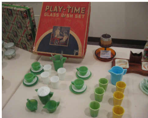
Akro Agate Concentric Rib dish and beverage boxed set