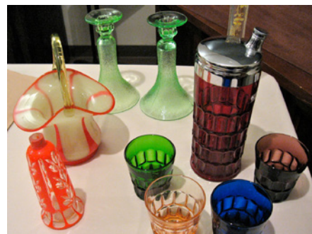
Kralik basket, Tiffin Brilliancy candleholders, Bohemian vase, Hostmaster cocktail set, Czech perfume bottle