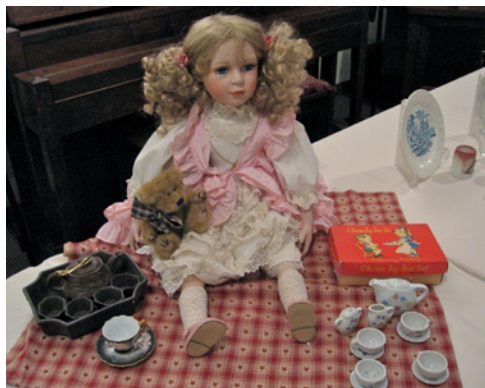
1950's china toy tea set, doll and bear, moriage cup & saucer c. 1950's, Chinese stoneware teapot set in tray with four cups