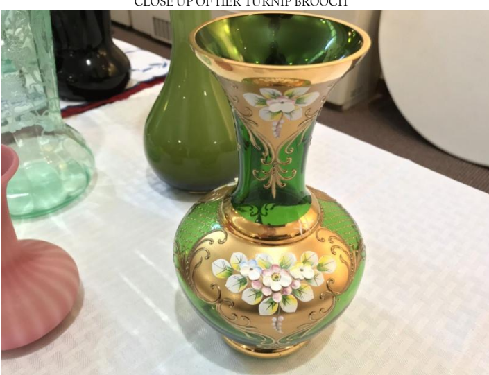
CLOSE UP OF ITALIAN DECORATED VASE, SIMILAR TO CZECH DECORATION