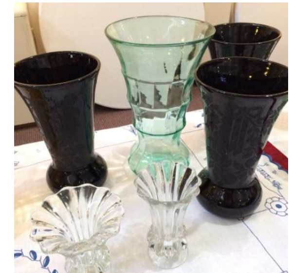
BACK ROW: BLACK PADEN CITY VASES AND GREEN \sharp 195 PADEN CITY VASE; FRONT ROW: HEISEY