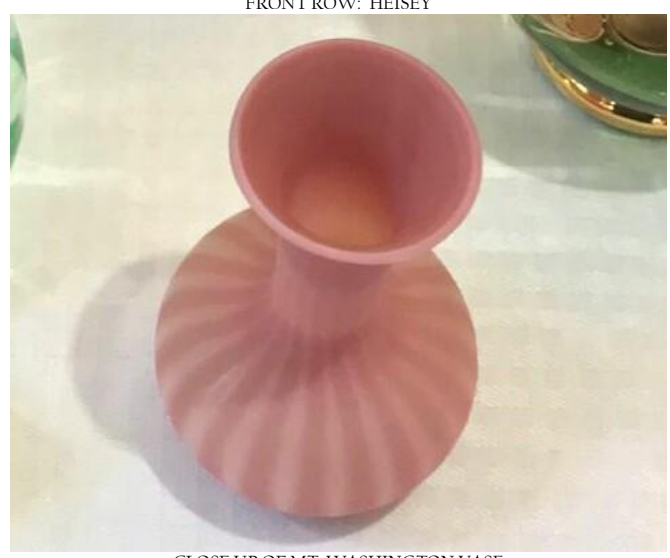
CLOSE UP OF MT. WASHINGTON VASE