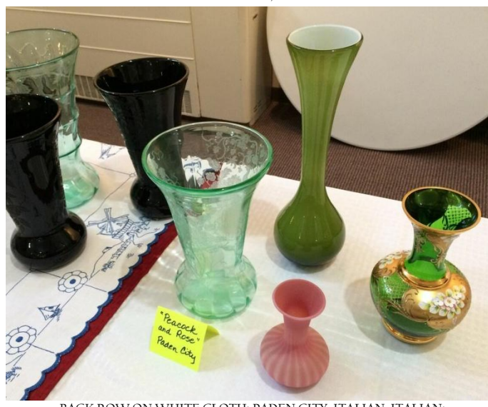
BACK ROW ON WHITE CLOTH: PADEN CITY, ITALIAN, ITALIAN; FRONT ROW: MT. WASHINGTON