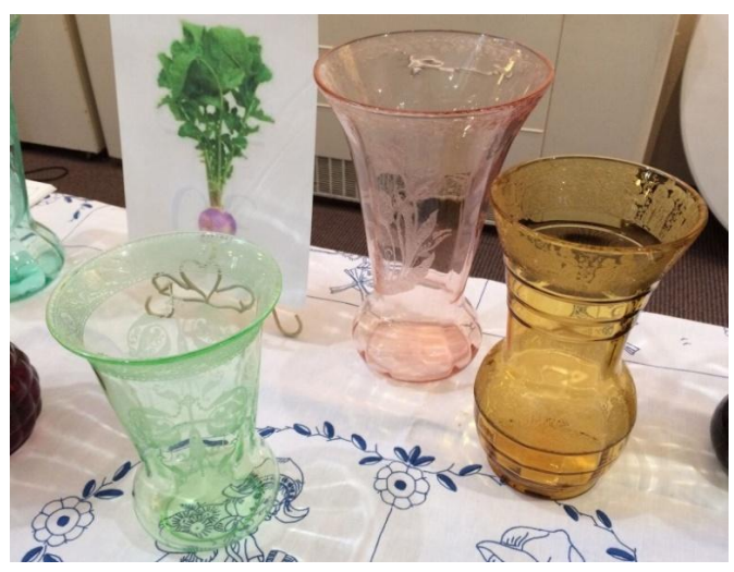
FROM LEFT: CAMBRIDGE, CAMBRIDGE & PADEN CITY