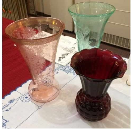
FROM LEFT: PADEN CITY, CAMBRIDGE & ANCHOR HOCKING

Some other companies' vases have round, ball-like bottoms, but their middles and tops are not turnip-shaped. Since TURNIP is my made-up nickname, I'm not counting them as TURNIPS, but you can if you wish because if you own one, you own the naming rights!!