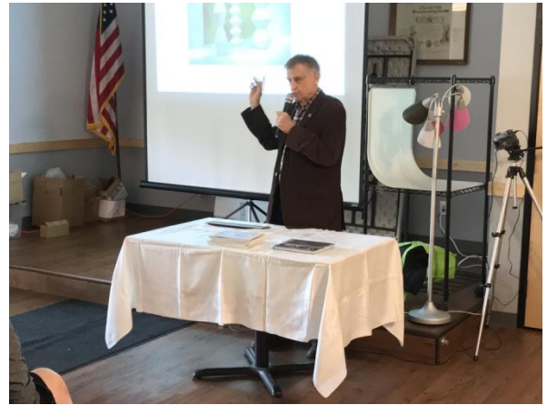
SPEAKER BILL STERN TALKING ABOUT CALIFORNIA POTTERY