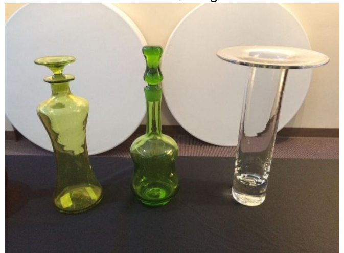
c. 1955 & 1957 three amberina vases designed by Husted; an amber vase; c. 1955 green decanter with original sticker from Eureka CA designed by Husted; c. 1970 olive green decanter designed by Myers; c. 1982 vase with clear, flat rim.