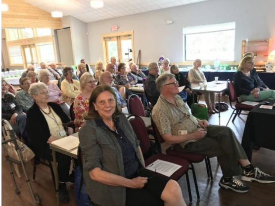
WE HAD A GOOD CROWD ATTENDING THE LECTURES!