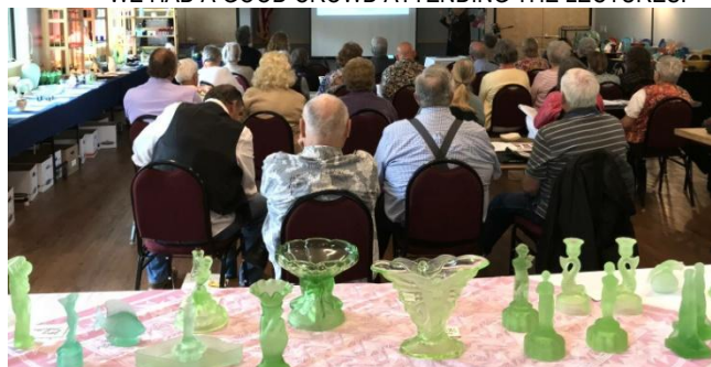
RICHARD GLENN'S FIGURAL FROGS AND OTHER GREEN SATIN PIECES