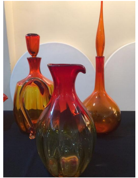
c. 1960 lamp with original teak bottom in orange crackle, designed by Wayne Husted; c. 1960 amberina ruffled bowl; c. 1972 blue pitcher designed by John Nickerson; blue highball glass; c. 1964 orange and red Joel Myers decanter; c. 1962 large flame decanter designed by Husted; c. 1964 tangerine pitcher designed by Myers.