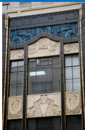
TERRA COTTA DETAIL ON CHARLES F. BERG BLDG., PORTLAND OR