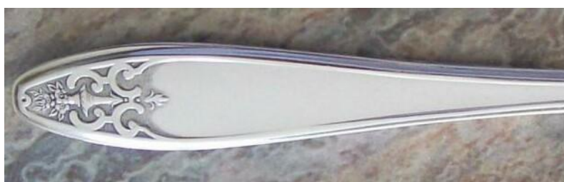
PRINCESS BY WILLIAM ROGERS